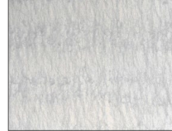
Correct = 20 dry gms/m 2